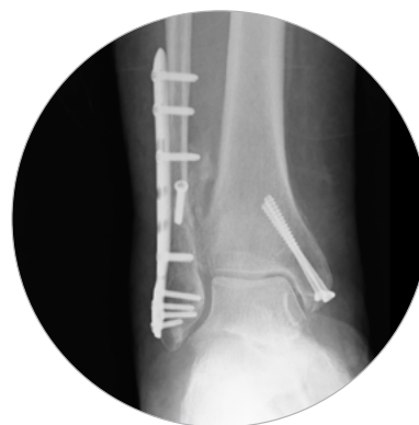
10 months postoperative

This fracture pattern can be difficult to treat due to the fibular comminution. The necessary tools, instruments, plates, and screws required to complete ORIF of ankle fractures are included in the Acumed Ankle Plating System 3. The Lateral Fibula Plate has an excellent fit. With anatomic rigid fixation, the patient was allowed to weight-bear earlier, allowing faster rehabilitation.