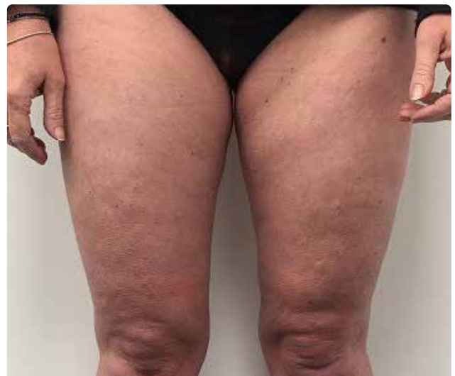
Follow-up after the 2 nd session.