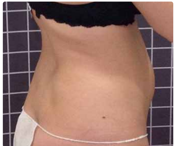
30 days after 1 single session.