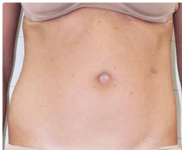
35 days after the 2 nd session.