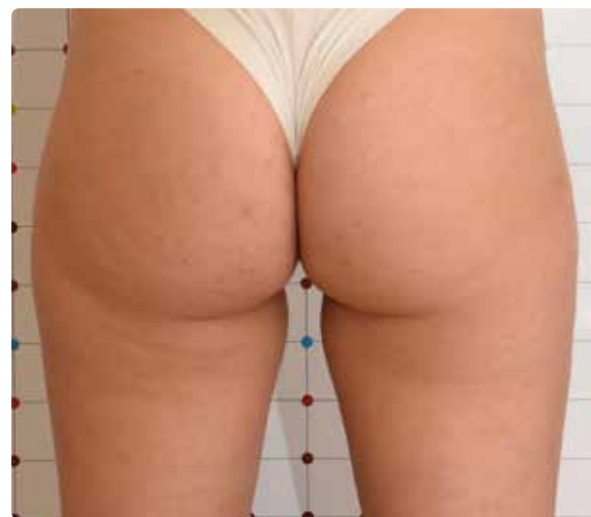
35 days after the 2 nd session.