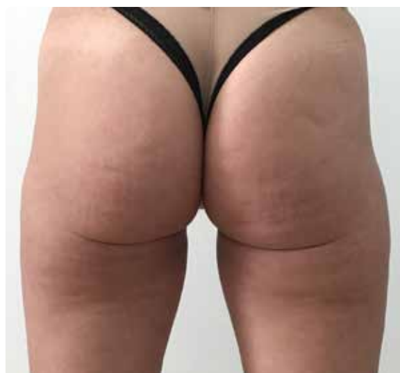
30 days after 1 single session.