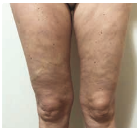
Follow-up after the 1 st session.