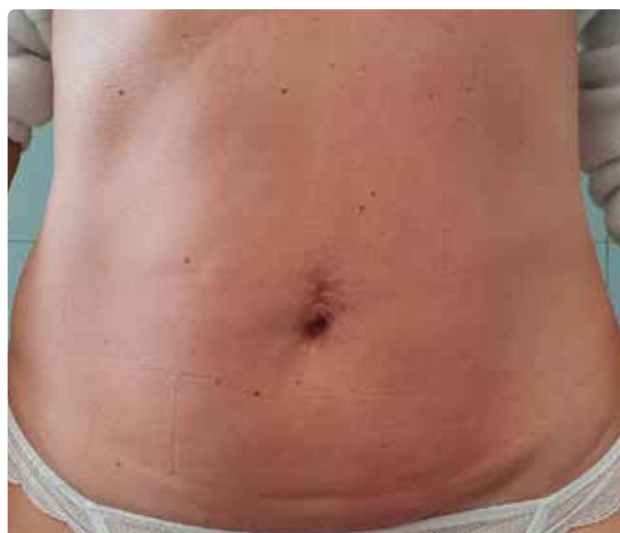
30 days after the 4 th treatment.