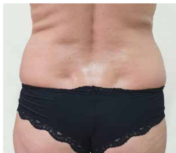
30 days after the 2 nd session.