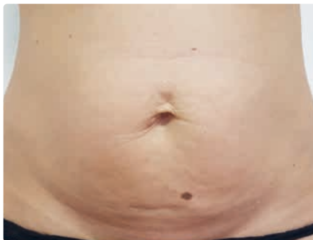
30 days after 1 single session.