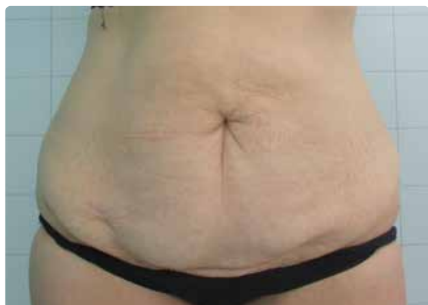
Follow-up after the 2 nd session.