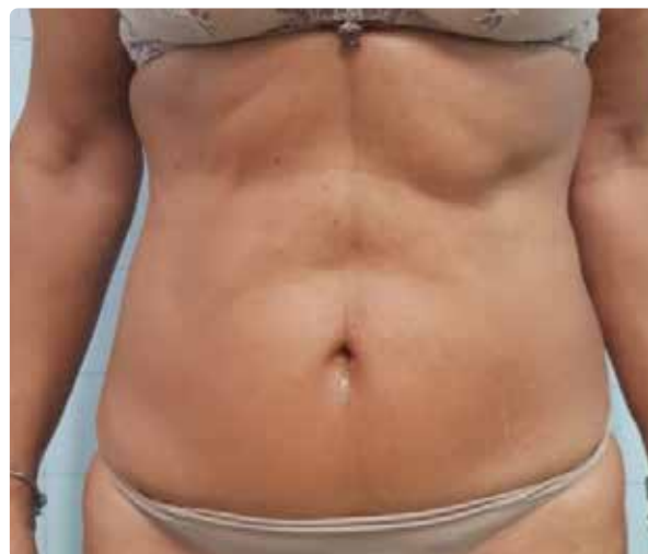
30 days after 1 single session.