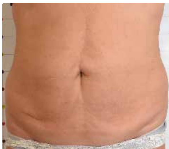
45 days after 1 single session.