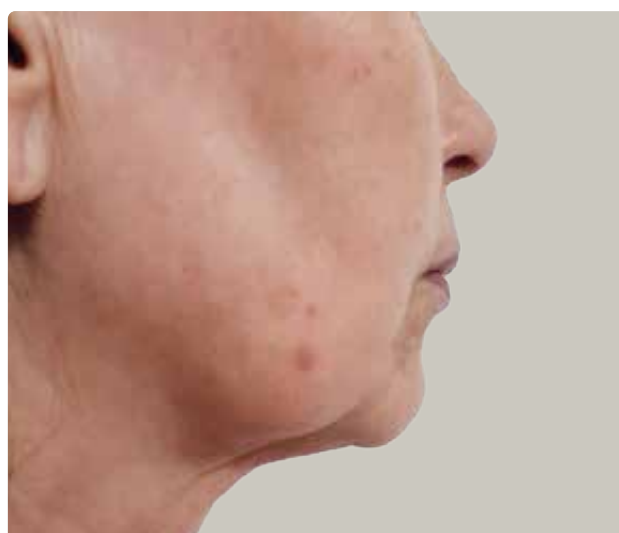
After 4 sessions.