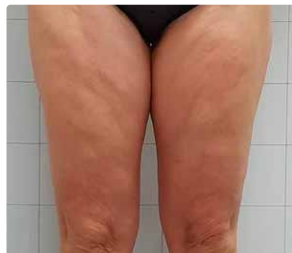
60 days after the 2 nd treatment.