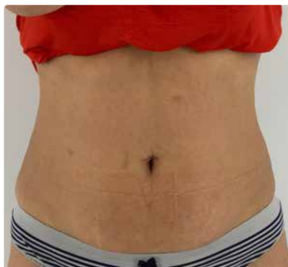
45 days after 1 single session.