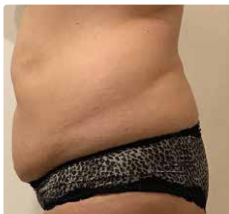
Follow-up after the 2 nd session.