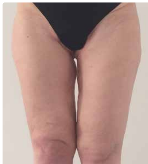
Follow-up after the 3 rd session.