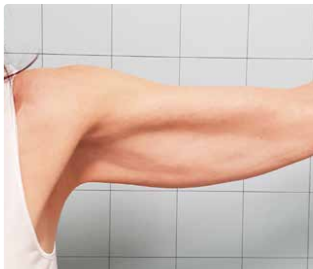
30 days after the 3 rd treatment.