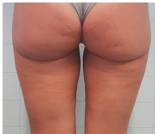
30 days after 1 single session.