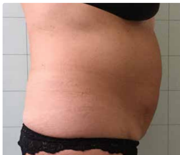
30 days after the 3 rd treatment.