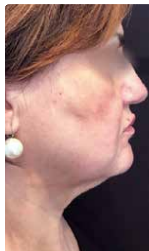
After 3 sessions.