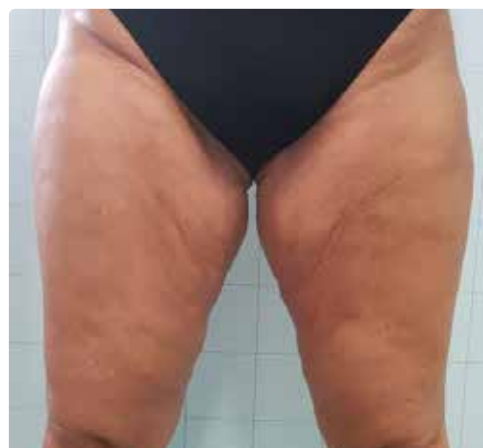
30 days after 1 single session.