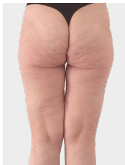
50 days after 1 single session.