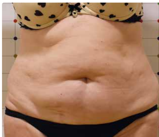
30 days after the 2 nd session.