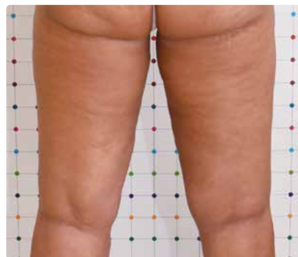
Follow-up after the 3 rd session.