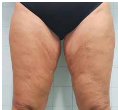
60 days after 1 single session.