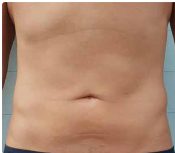
30 days after the 3 rd treatment.