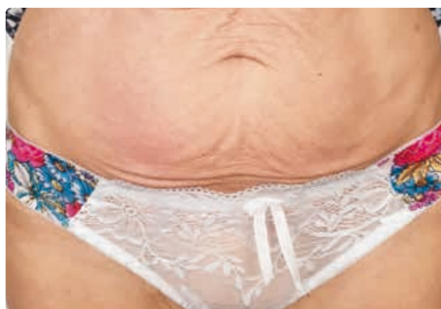
4 months after the 1 st session.