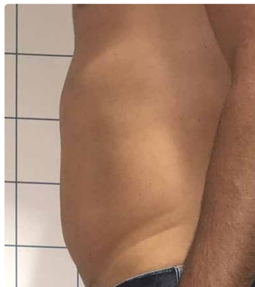
Follow-up after the 2 nd session.