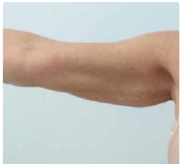
Follow-up after the 2 nd session.