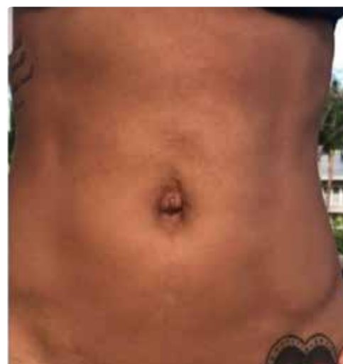
60 days after 1 single session.