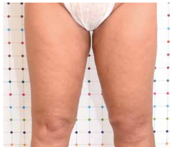
Follow-up after the 3 rd session.