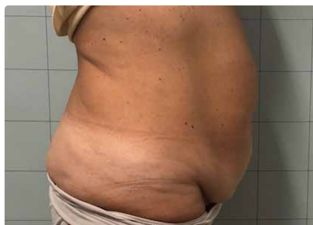
30 days after the 3 rd treatment.