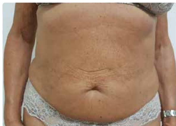
30 days after 1 single session.