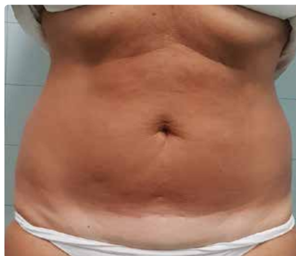
45 days after 1 single session.