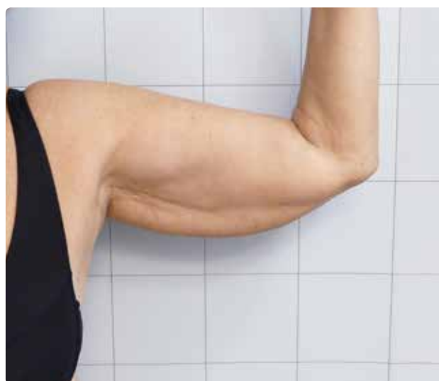
Follow-up after the 3 rd session.