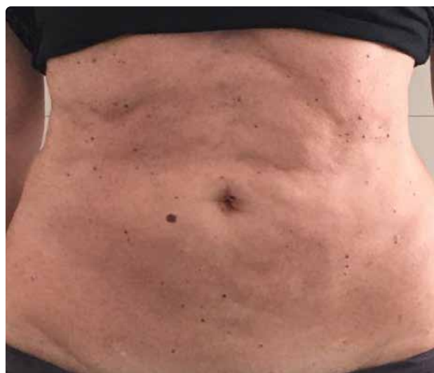
30 days after 1 single session.