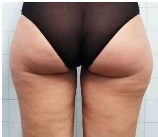
30 days after the 4 th treatment.