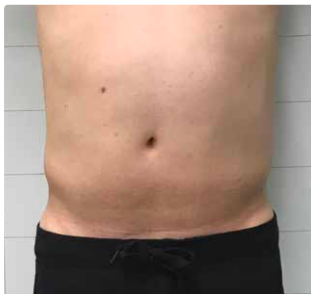
35 days after the 2 nd session.