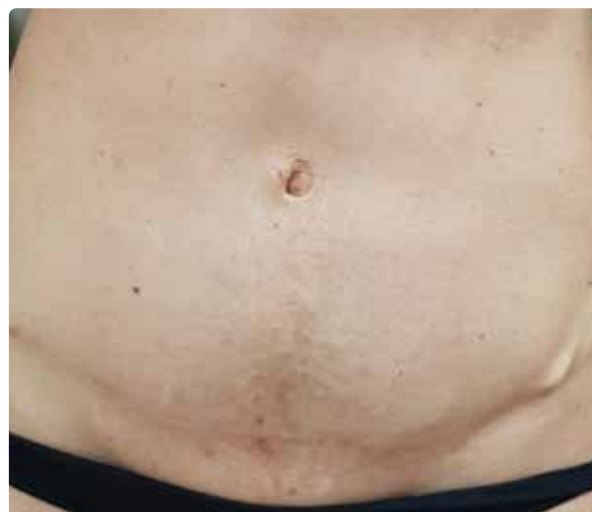
30 days after 1 single session.