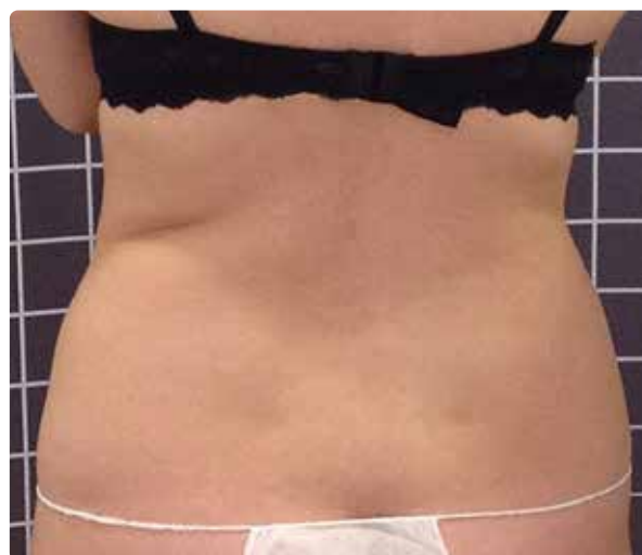
30 days after 1 single session.