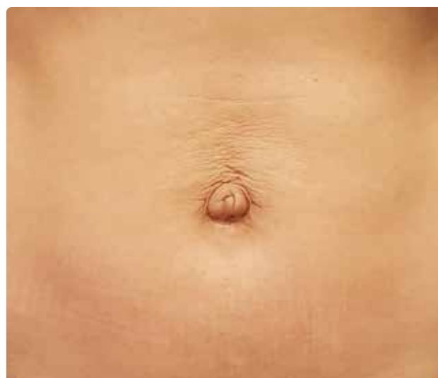
30 days after the 3 rd treatment.