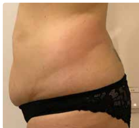
Follow-up after the 3 rd session.