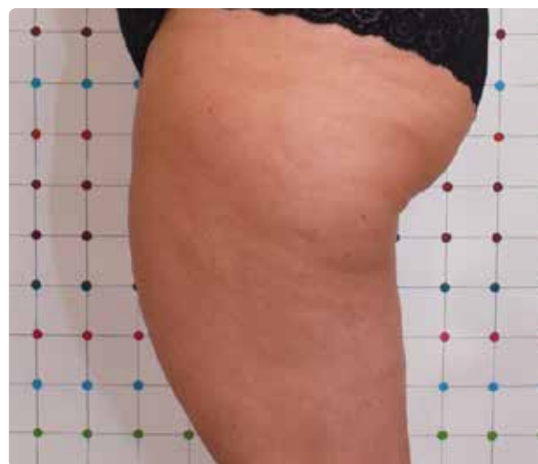
Follow-up after the 4 th session.