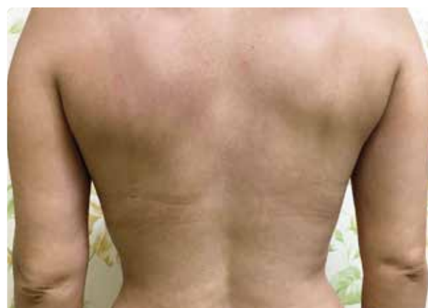
90 days after 1 single session.