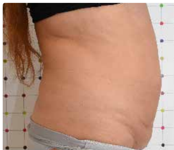
45 days after 1 single session.