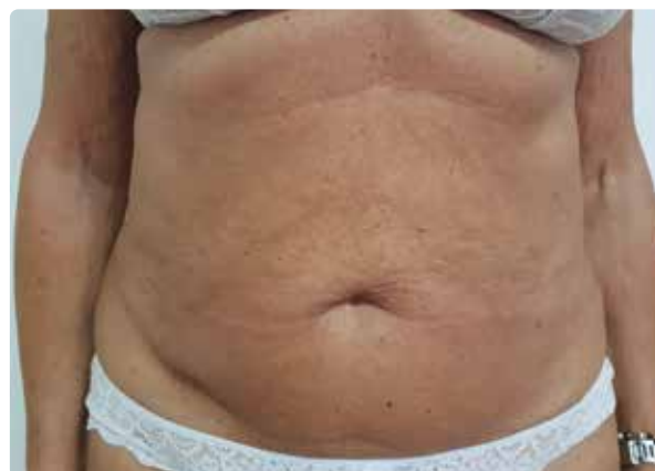
60 days after 1 single session.