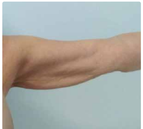
Follow-up after the 2 nd session.