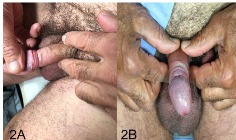
Figure 2. Penile Lichen Sclerosus Before (a) and After (b) Treatment.

patient tolerated the treatment well, and he did not report any side effects.