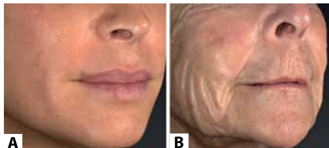
FIGURE 1: Perioral Aging - A: Young lips; B: Aged lips

Analyzing the standardized photographs with the Vectra H1 camera, it was possible to observe an improvement in