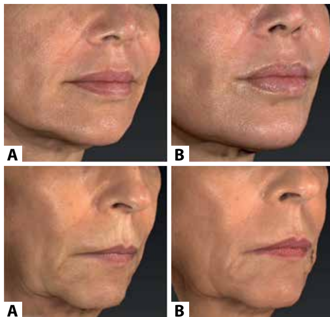
FIGURE 3: A - Before; B - After five laser sessions

the projection of the upper lip: 40% of the cases had a 5° decrease in the nasolabial angle, while 60% of cases experienced a 3° decrease.