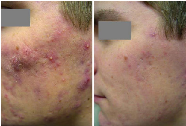
Figure 4: a) Moderate inflammatory acne as well as acne scars visible on the cheeks and chin before 1064 nm Nd:YAG laser treatment. b) After only one treatment session significant reduction of acne vulgaris was observed.

Significant clearance of acne as well as acne scar improvement with no side effect was observed after the laser treatment.