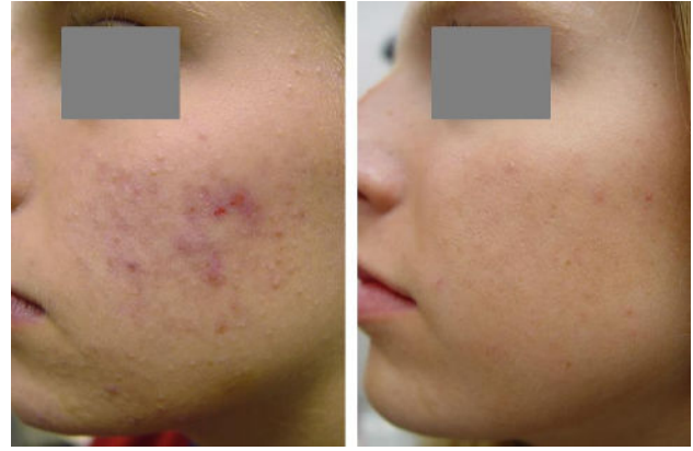
Figure 2: a) Acne vulgaris with papules and pustules on cheeks after several years of unsuccessful treatment with medications (before 1064 nm Nd:YAG treatment). b) Complete clearance observed after a single laser treatment.

With a single treatment, complete clearance with no side effects was achieved (Fig. 2B). No reoccurrence was reported 10 years after the treatment.