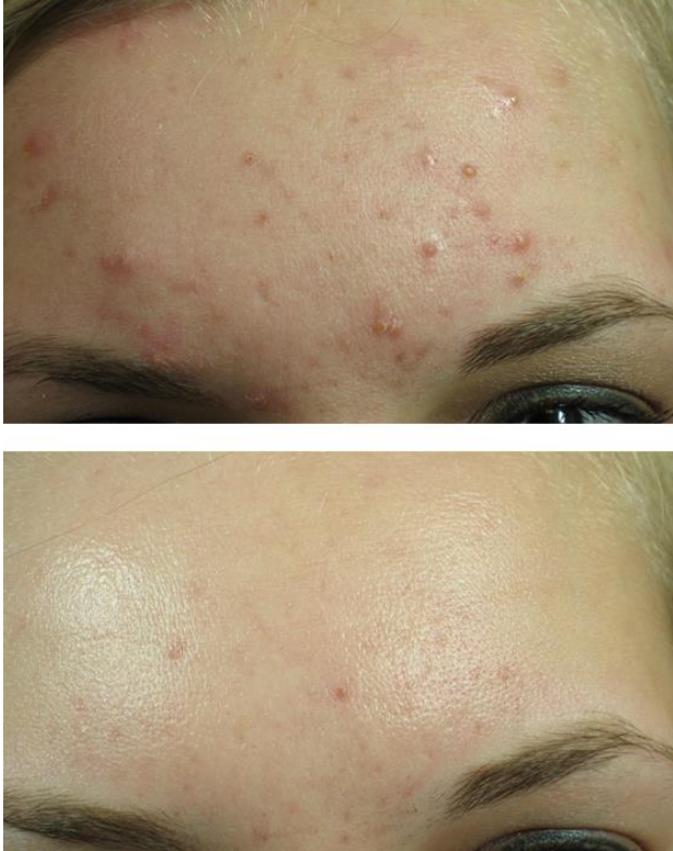
Figure 1: a) Mild acne vulgaris with multiple inflammatory papules on the forehead before the treatment with 1064 nm Nd:YAG laser. b) After only one session significant reduction of acne was detected.

Significant reduction of acne was observed after only one treatment with Nd:YAG laser (Fig. 1B). The maintenance of acne reduction was monitored and there was no sign of recurrence of acne even 5 years after the treatment. No side effect was noticed immediately or later after the treatment.