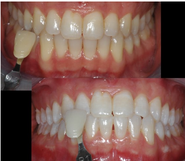
Fig. 8: Before (a) and after (b) TouchWhite™ procedure.

The activation of the bleaching gel (Figure 8) for tooth whitening is very successful with the help of the Er:YAG laser [38,39] with very long pulses. The procedure is patented and known as the TouchWhite™ procedure. The overall treatment time as well as post-operative sensitivity is decreased.