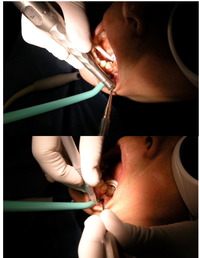
Fig. 1: Buccal opening, root resection and surface modification of the peri-apical lesion on the lower left first molar with the Er:YAG laser (a). Decontamination with the Nd:YAG laser (b). With permission of Dr. Kresimir Simunovic.

The absence of vibrations, faster healing of soft and bone tissues and relatively pain-free recovery, in addition to bactericidal and biostimulatory effects, make the Er:YAG laser an important surgical instrument. In special situations, such as the treatment of osteonecrosis of the jaws in patients under bisphosphonate therapy, these features become even more important [5]. Treatment success is completed with the LLLT step, provided by the Nd:YAG laser.