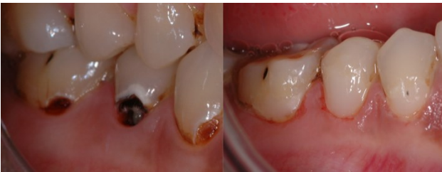
Fig. 7: Clinical case before treatment (a). Immediately after gingivectomy and carious lesion removal.

The activation of the bleaching gel (Figure 8) for tooth whitening is very successful with the help of the Er:YAG laser [38,39] with very long pulses. The procedure is patented and known as the TouchWhite™ procedure. The overall treatment time as well as post-operative sensitivity is decreased.