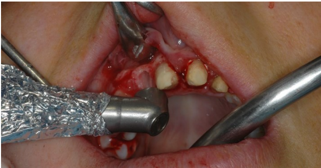
Fig. 4: Cleaning and disinfecting the socket with an Er:YAG laser after extraction.

After the removal of granulation tissues and superficial disinfection [27], the Nd:YAG laser is used for deep disinfection and a biomodulation effect that helps with healing, leading to less edema and pain.