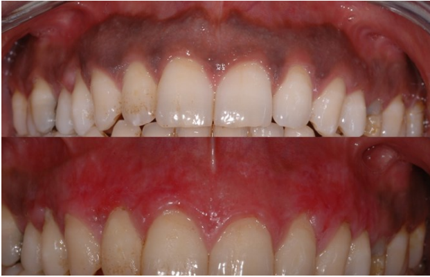
Fig. 6: Gingival depigmentation before treatment(a). Gingival depigmentation 7days after treatment (b).