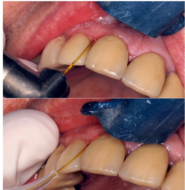
Fig 3: Laser assisted closed perio debridement: initial superficial decontamination and ablation of granulomatous tissue with Er:YAG (a). Deep decontamination and biomodulation with the Nd:YAG laser (b).

Modern periodontal therapy deals with effective removal of infected soft and hard tissue during surgical or non-surgical therapy. There are various benefits of the combined use of laser-assisted and classical methods of periodontal treatments. The Er:YAG laser with an appropriate fiber tip is used for concrement and calculus ablation [10] while removing bacteria [11,12], endotoxins [13] and lipopolysaccharide on the hard root surface, and the elimination of granulomatous tissue on the soft gingival side. The Nd:YAG laser is an indispensable tool to initially decontaminate the pocket [14-17], as well as to deepithelise. Laser-assisted treatment provides successful clinical and microbial results as they are the best solution for decontamination and smear layer removal; eliminating the cause of the periodontal problem and providing a better surface for fibroblast attachment [18]. Both wavelengths help to improve the treatment outcomes [19-23] and patient comfort [21,24-26]. The TwinLight combination of Er:YAG and Nd:YAG laser-assisted, minimally invasive periodontal treatment (Figure 3) is able to replace classical invasive surgery or ease the procedure with increased access, selective removal of tissues and biomodulation during the surgical approach.