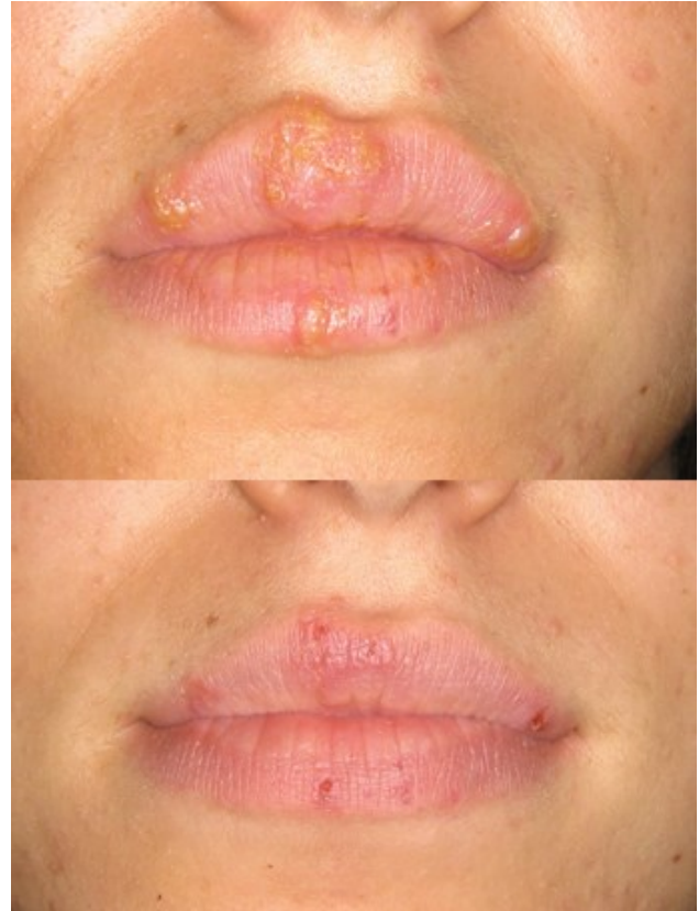
Fig. 9: Before (a) and 4 days after (b) treatment of herpetic lesions.

The Nd:YAG laser can also be used for the treatment of herpetic lesions (Figure 9). The advantages of treating a herpetic lesion by laser are that the pain is relieved shortly after lasing, the lesion is healed faster and reoccurrence is less frequent at the treated area.