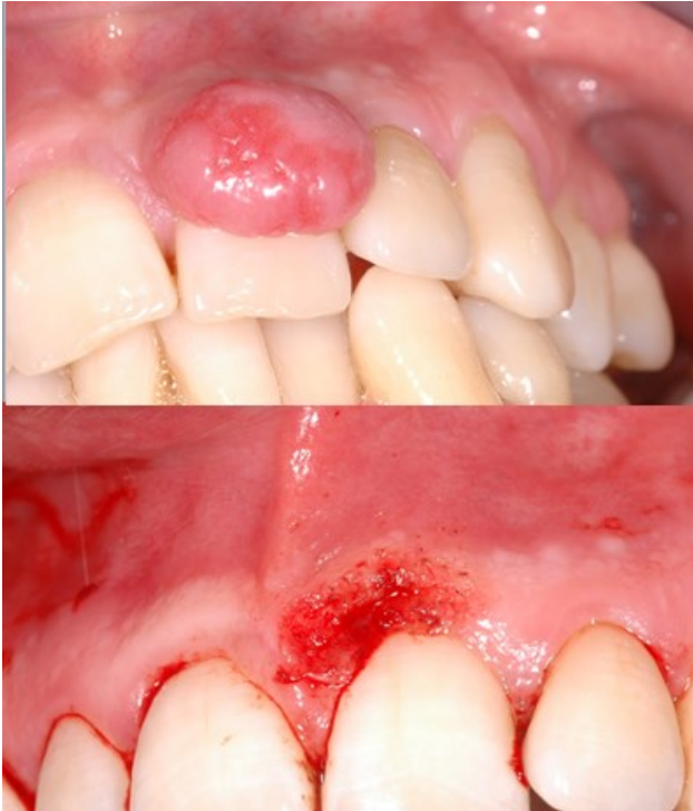
Fig. 10: Before removal of overgrown tissues (a) and immediately after the removal with an erbium laser (b).